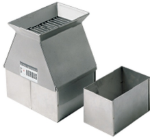
Stainless steel sample splitter, No 16x5 mm chutes 15-D0431