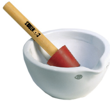
Rubber headed pestle 16-D1179/A with soil mortar 86-D1180/1